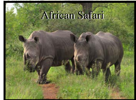
(A once in a lifetime adventure)