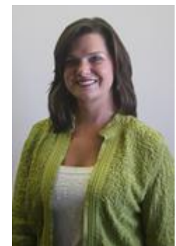
Chelsey West Coast Swing

60 seconds every 30 days could save your life